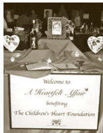
Heartfelt Affair welcoming table.