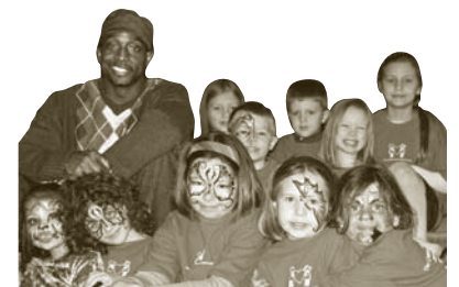
Charles “Peanut” Tillman and the kids.