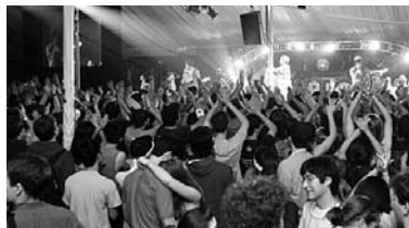
Northwestern University Dance Marathon